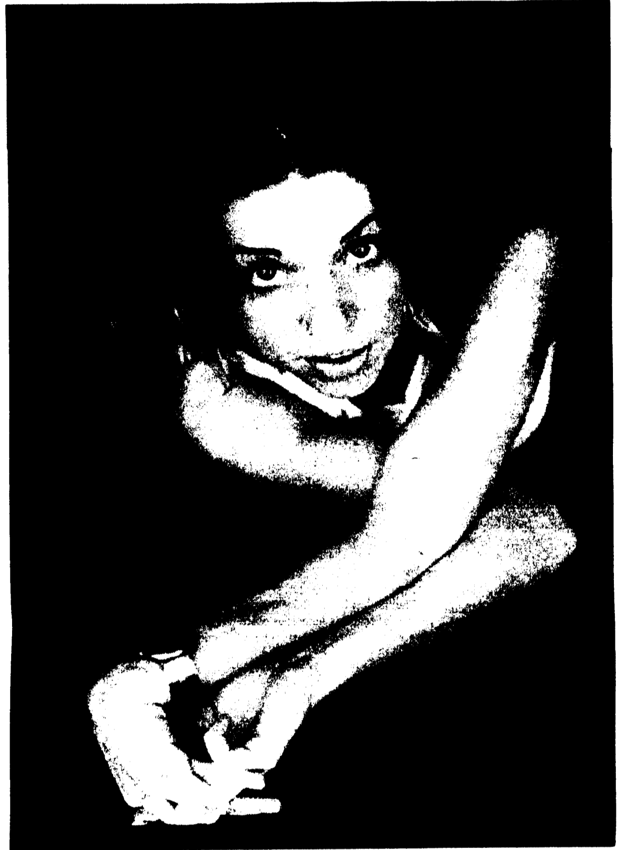
Singer, songwriter and guitarist Ani DiFranco released her album, Up, Up, Up, Up, Up, Up last week. Look for a review in Features next week.