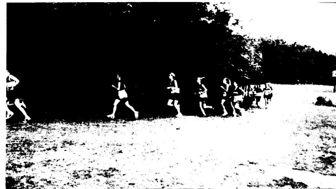
Cross Country runners in Saturday's Invitational run through Behrend's playing fields

Next up for the Lions will be the Alfred Invitational this Saturday, September 26.