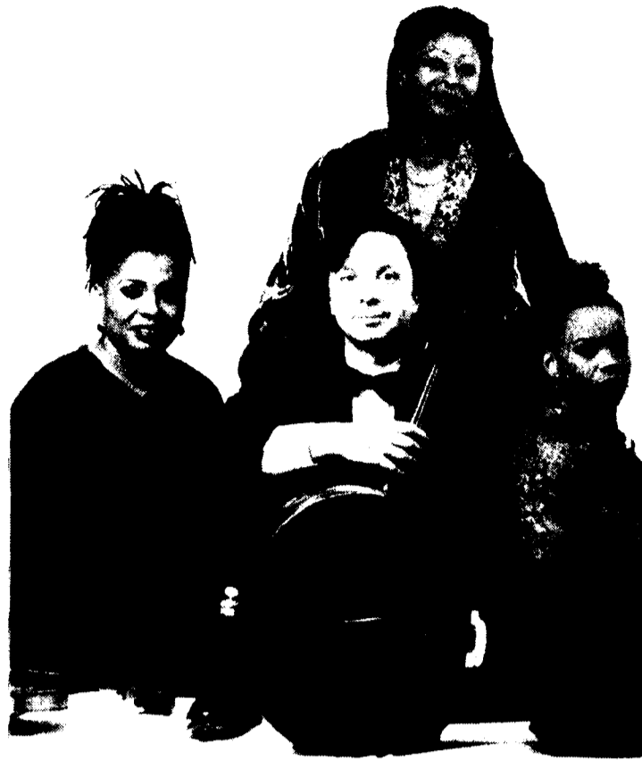
Quartette Indigo, performing at noon on Tuesday September 29 as part of the Logan Music Series