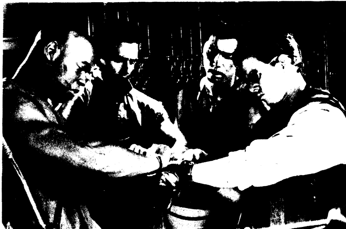
(Left to right) Crunch (Bokeem Woodbine), Vince (Antonio Sabato, Jr), Cisco (Lou Diamond Phillips), and Mel (Mark Wahlberg) are a quartet of hitmen in The Big Hit .

agrees to participate in the kidnapping of Keiko Nishi (China Chow), the daughter of Jiro Nishi, a wealthy businessman. However, unbeknownst to Melvin and the other kidnapers, Nishi has just recently gone bankrupt and Keiko happens to be Paris' goddaughter.