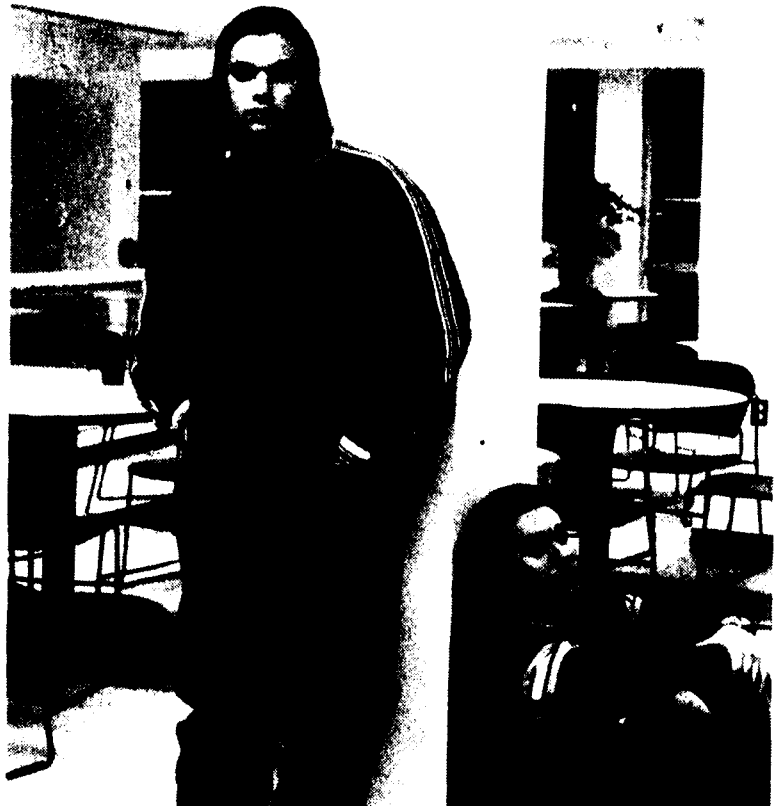
Gloss will perform in Bruno's on Tuesday, April 7 at 8:00 p.m.