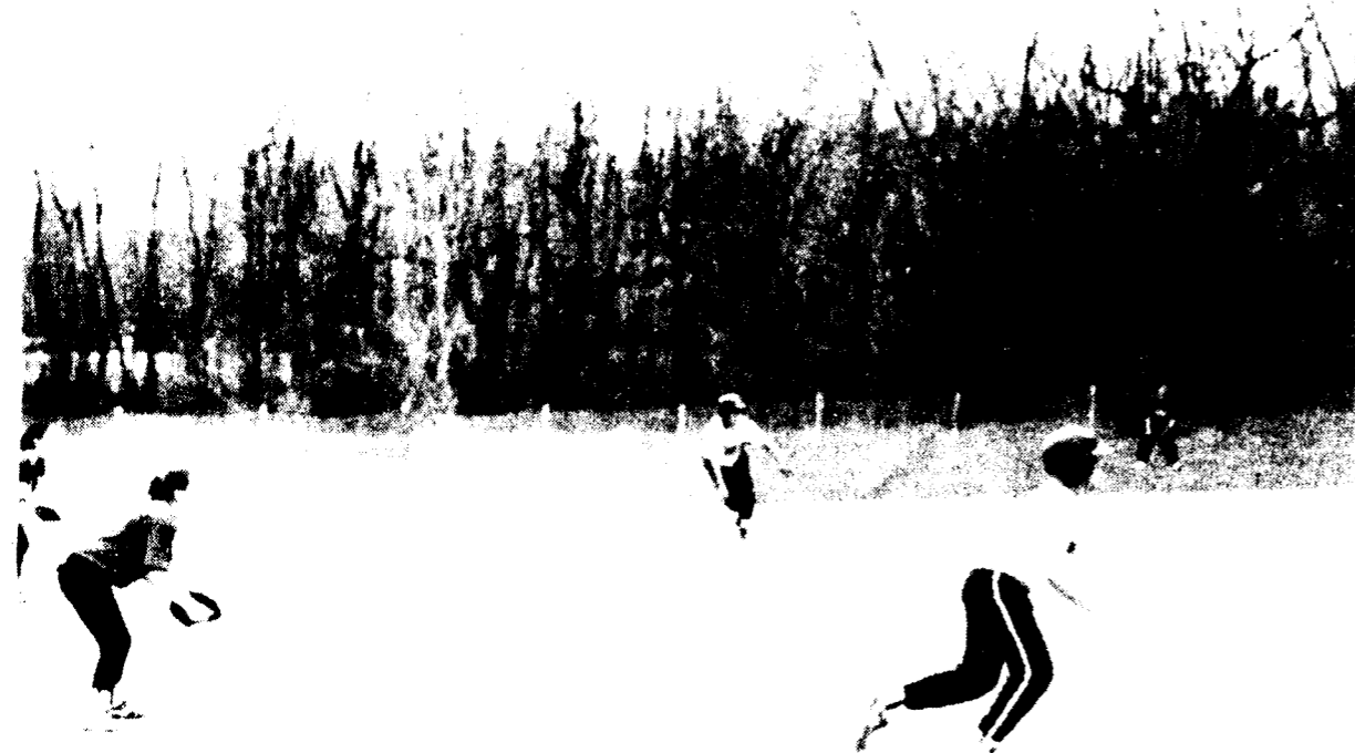
The Lions move around the base paths all day against Lake Erie as they outscore their opponents 28-1 in both games.

Lions move AMCC record to 3-1, while moving overall record to 4-8