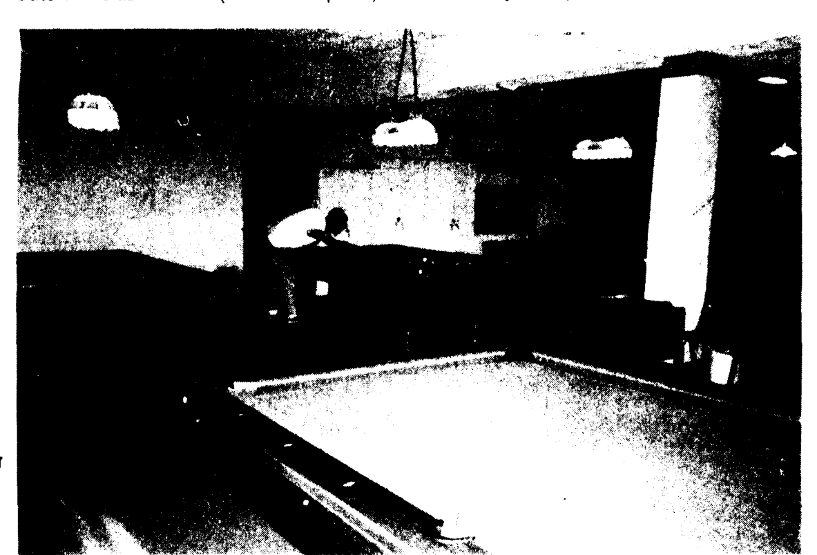
A student shooting pool in the Reed Building's Back Room. Story in next week's Features.

Sexy Blue Bay High guidance couselor Sam Lombardo (Matt Dillon) and Blue Bay outsider Suzie Toller (Neve Campbell) make unlikely conspirators in Wild Things.