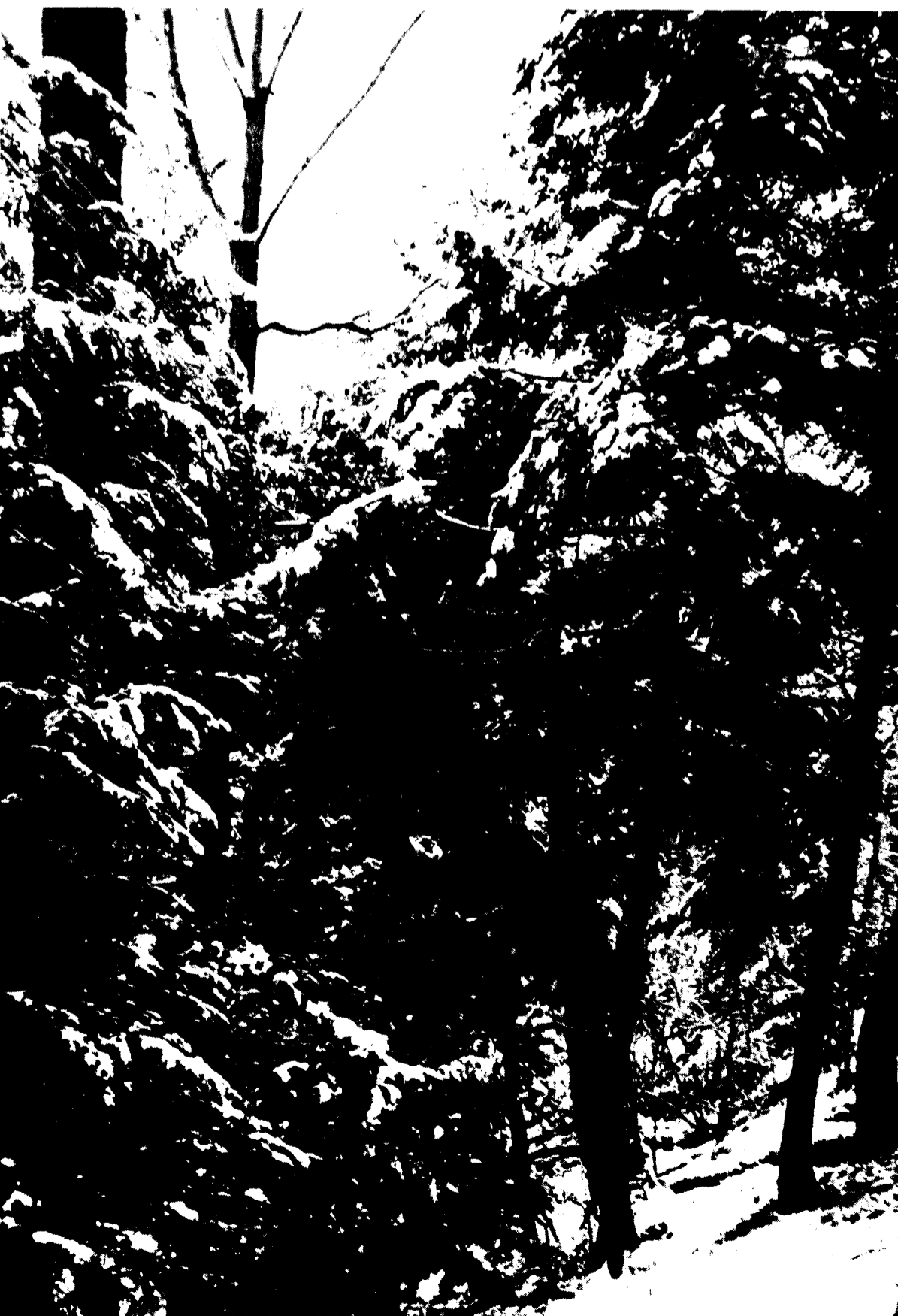
Winter made its last appearance in Wintergreen Gorge last weekend. Spring has begun!