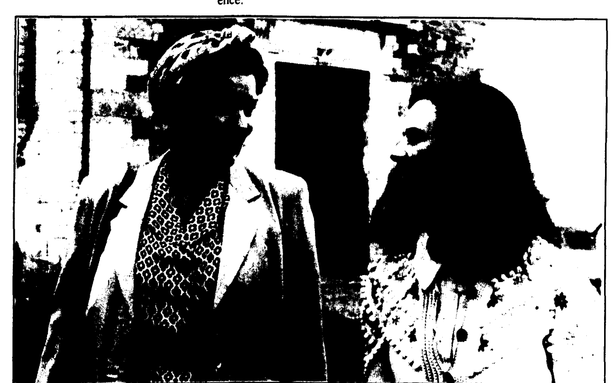
"Antonia's Line," is being shown on Tuesday, March 31in the Reed Lecture Hall at 7:00 p.m. Antonia and her daughter Danielle return to the village Antonia left as a vound woman. The picture will continue the Women's Film Series.