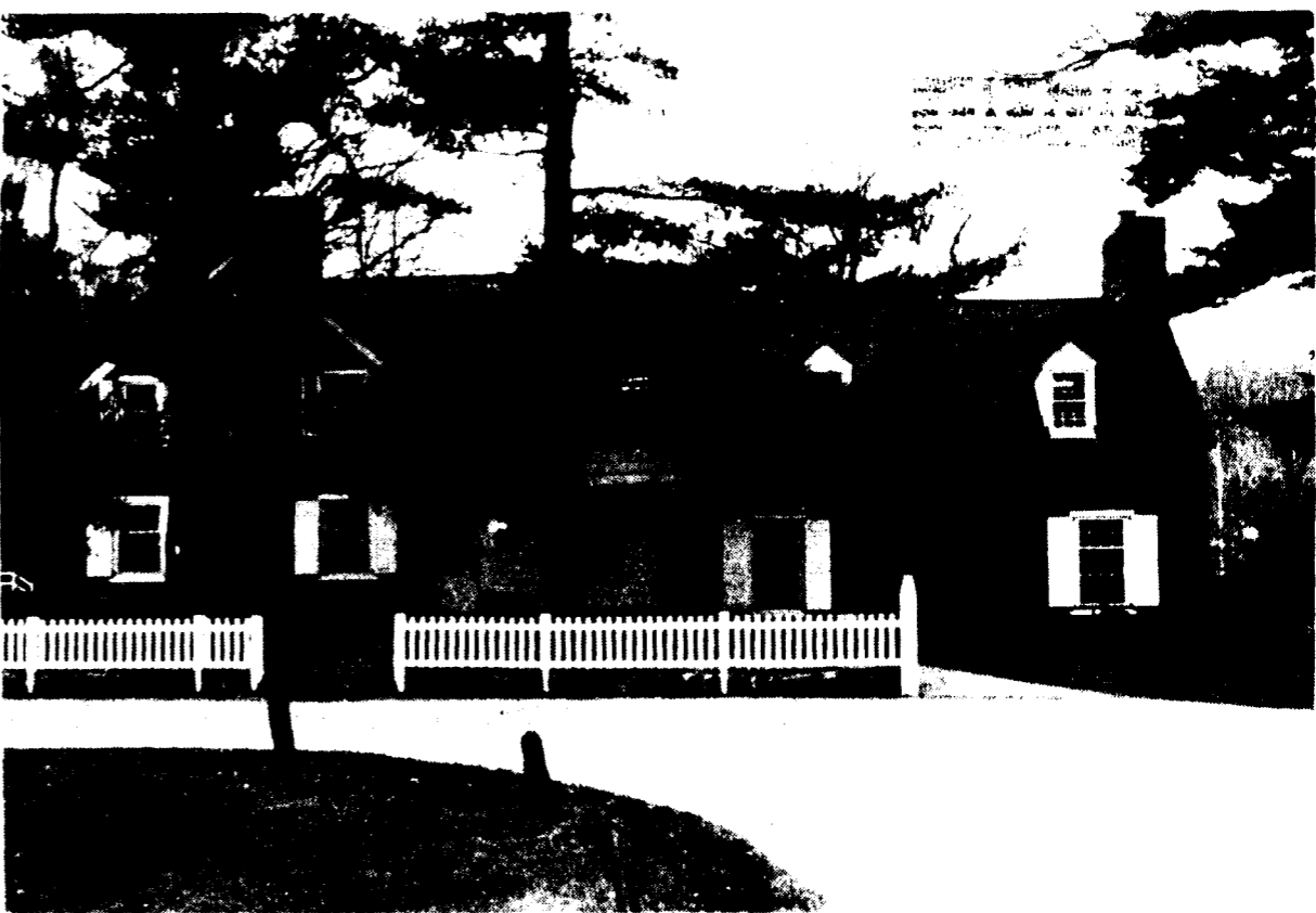
Glenhill Farmhouse contains the Office of Admissions