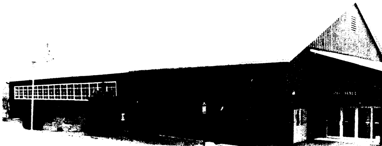
Erie Hall, where all graduation ceremonies will occur this May if weather prevents them from being outdoors

The general consensus among those interviewed was that as long as the announcements get the job done, the look isn't all that important. Price seemed to be the main issue, as students seemed to think the price was fair as long as it didn't go any higher.