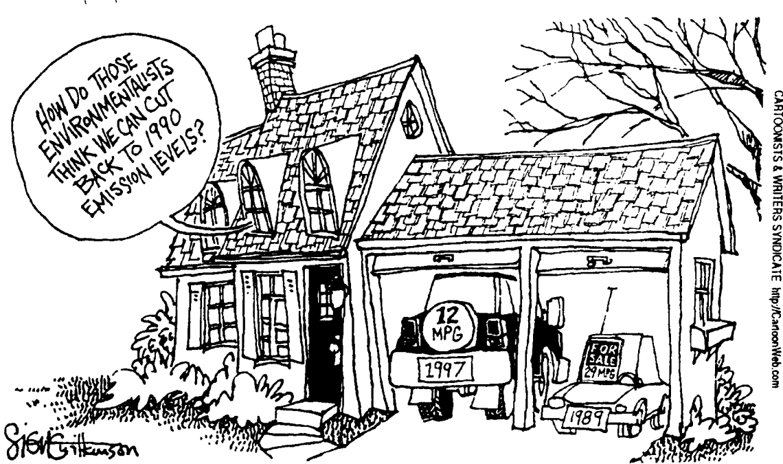
CARTOONISTS & WRITERS SYNDICATE http://Cartoonists.com