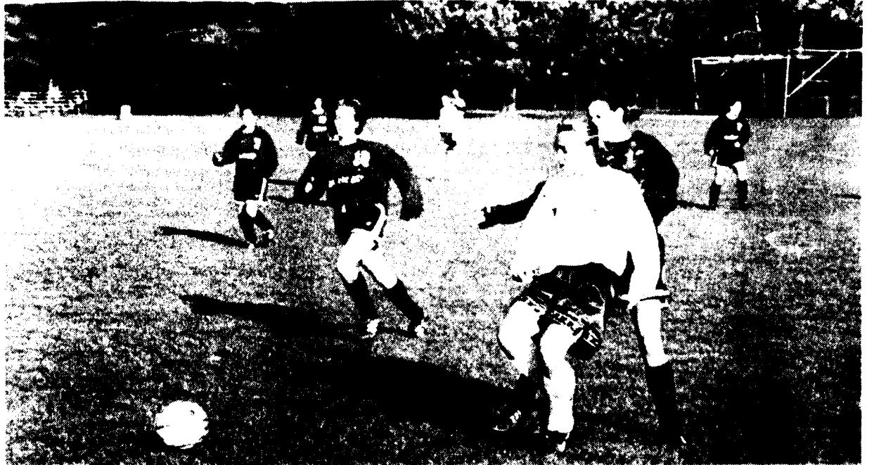
My ball! A Behrend player attempts to hold of an opponent as the ball spins her way. The Lady Lions have won four games in row, including three last week.