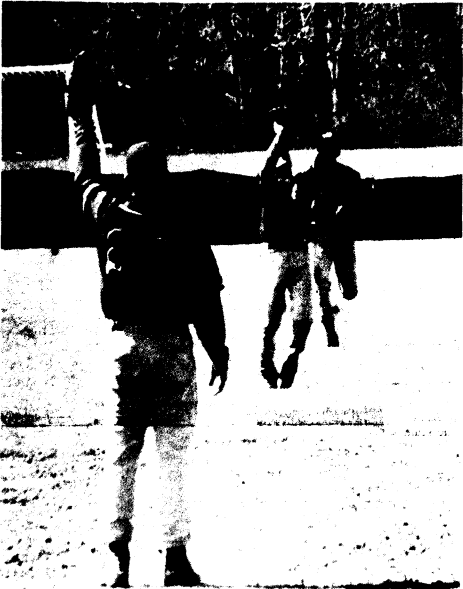
I got it! Unidentified Behrend players shag fly balls before a recent game.