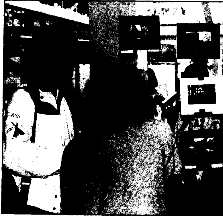
A picture is worth a thousand words- Art students are also able to display their photographic talent.