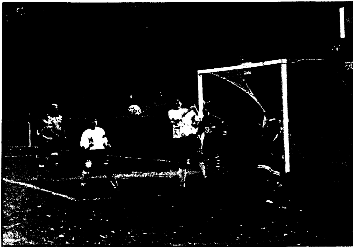
Spring in Their Steps: The Penn State Behrend Lady Lion Soccer Team is right in the midst of their spring season of soccer. The Lady Lions will be challenged against Edinboro and Gannon in the upcoming weeks.