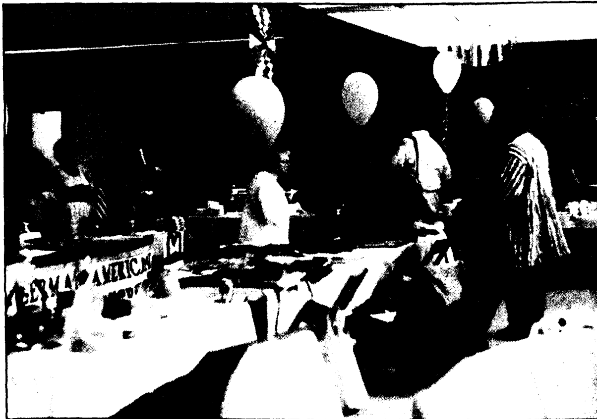
Cultural Fiesta was held Tuesday April 18th in the Reed Union Building. The world beat improvisation band Sangeta performed in addition to poetry readings and display booths.

This movie was good entertainment. It provided suspense mixed with laughter. It has many scenes that are unexpected, and ones that jump out at the audience. I thought this film was very entertaining. I liked the way that it was intertwined with a love story involving Roper and his ex-girlfriend, who are evolving into a couple again. I give Metro a thumb up for suspense, thrills, and variety. But from the woman's point of view, I gave it a thumb down because all of the blood and violence just does not impress me. Metro was created for the testosterone hormone in male audiences.