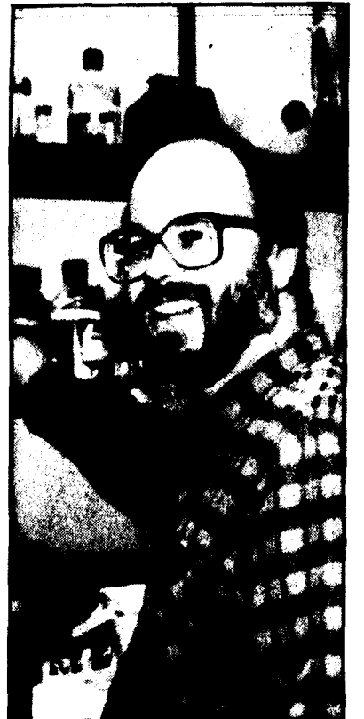
The challenger: Dr. Michael J. Behe challenges Darwin's theories of evolution.