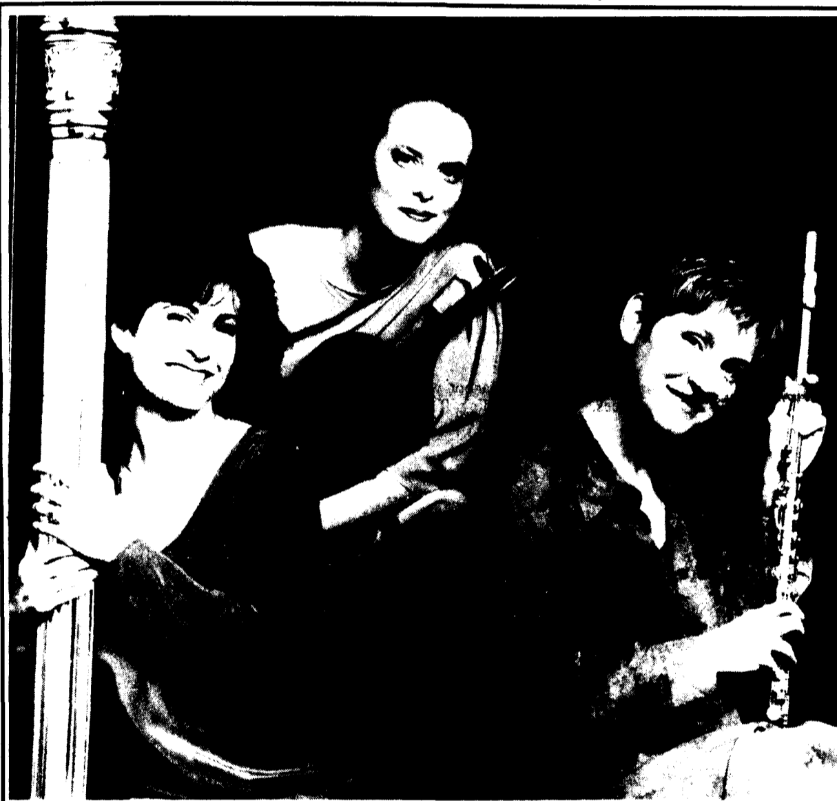
Aureole to appear at Behrend: The Logan Wintergarden Series will present Aureole on Tuesday, February 18 at noon. The performance, which is free and open to the public, will be held in the Wintergarden of the Reed Union Building. Audience members are encouraged to bring lunch and enjoy the performance as well as interaction and discussion with the musicians. For more information call 898-6000.

I suggest checking out this CD if a friend has it because if you don't have the guts to sway from your normal musical palette, you may be disappointed. But if you are willing to give this CD a chance, go for it...dive in head first and enjoy.