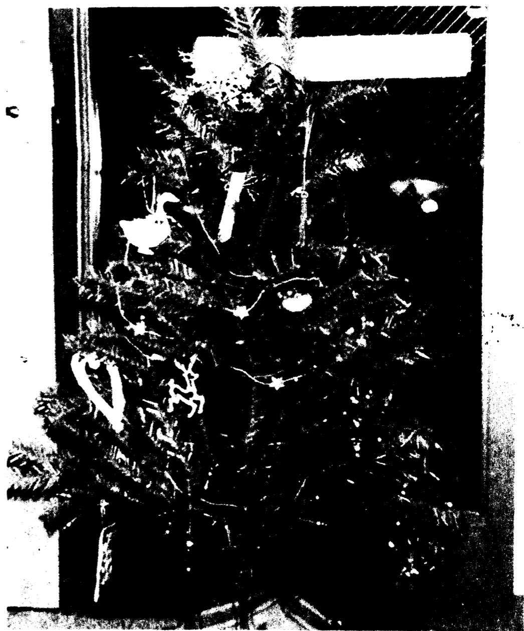
Charlie Brown Christmas: It's that time of the year again. This little tree is bringing bad memories of high credit card bills and good memories of presents and family.

Will be accepting applications on campus Thursday, December 5 9:00 a.m. - 2:00 p.m. Reed Building in front of the Radio Station