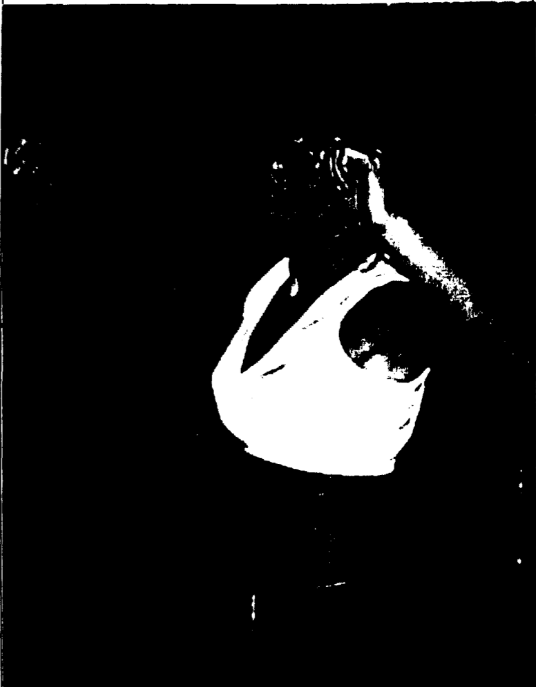
Gettin' down: This dancin' girl seems to be enjoying herself at last weekend's Friday Fiesta which was a great success.