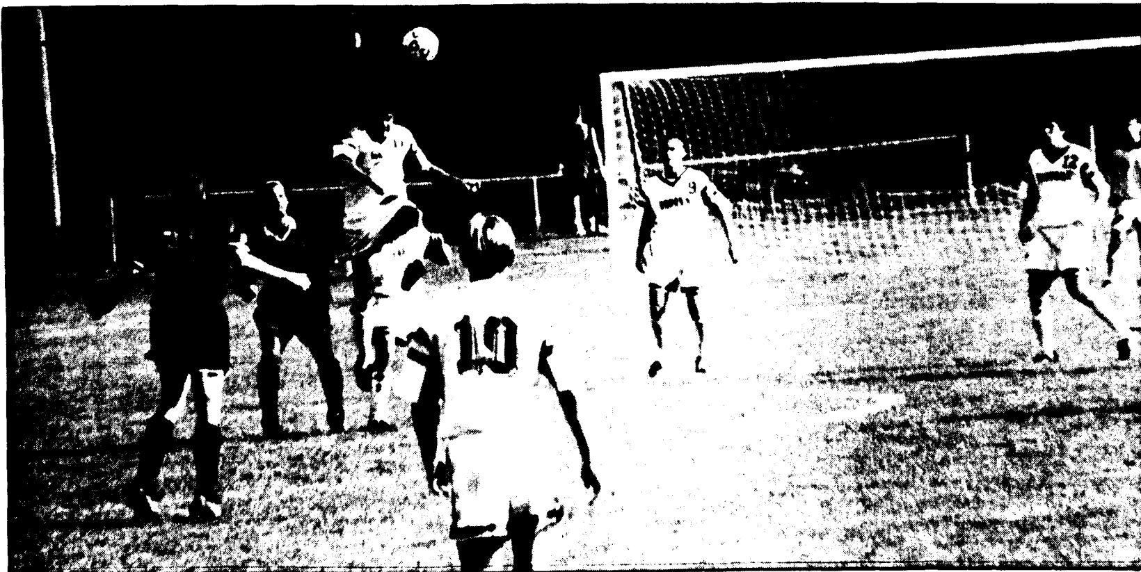
Roar like a Lion, Sting Like a Bee: The Lion soccer team finished a tough season with an 11-5-2 record. They won their last game 4-2 against the Waynesburg Yellow Jackets. The Lions are still waiting to see if they will make the playoffs. Next week we will take a look back at their incredible season.

"Those were special moments. They may not appreciate them now but in three or four years when they get together they will be very memorable," he said.