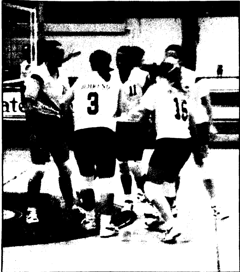
Ending on a winning note: The Lady Lions had a successful ending to their 1996 season as they won the Messiah Tournament. Behrend finished the season at 20-17.