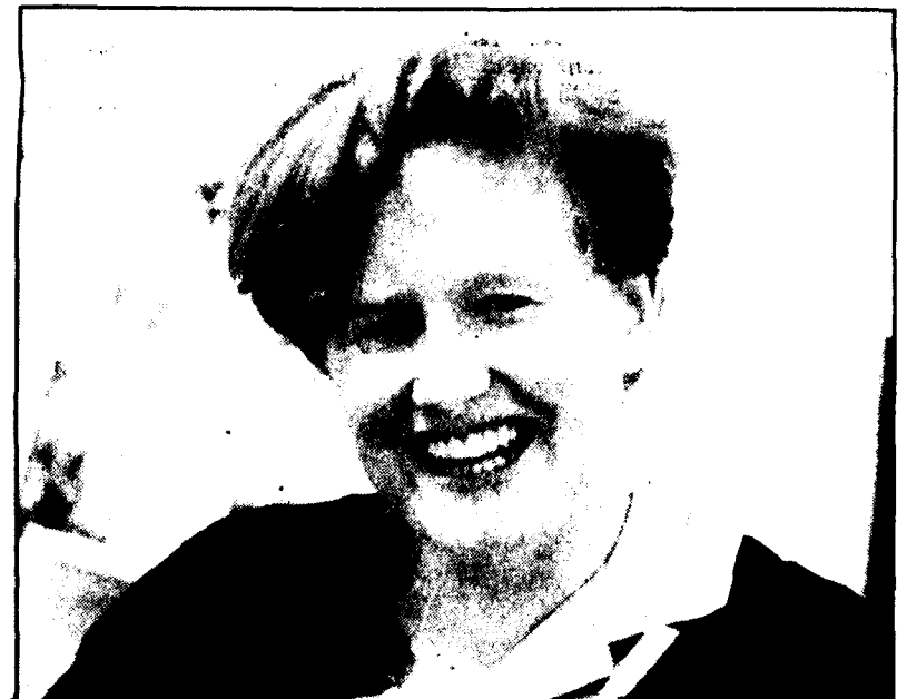
degrees from the University of Massachusetts and Columbia University. She currently teaches at Sarah Lawrence College.