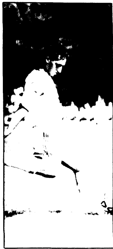
Lions still kicking: Despite a loss to CMU, the Lions are still hoping to make post-season.

The Penn State Behrend Lion soccer team suffered a setback on Tuesday but still finished the week at 1-1 to move their record to 10-5-1. They have won four of their last seven and ten out of thirteen.