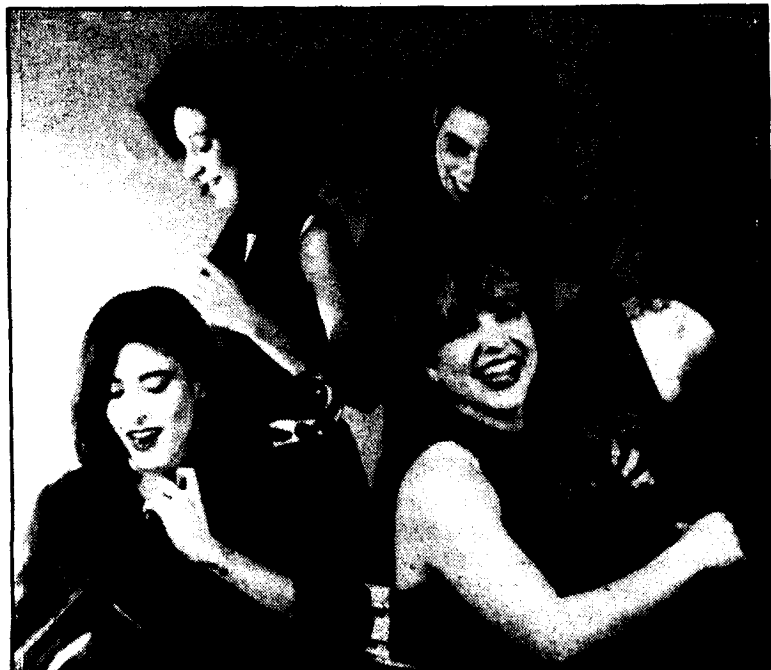
Music at Noon: Cello, a Cello quartet (surprised?) will perform in the Wintergarden this Friday.