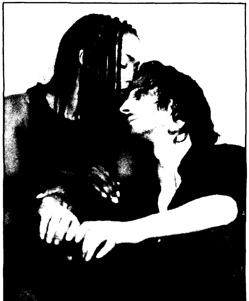
Strange Days: Ralph Fiennes, Angela Bassett, and Juliette Lewis star in the thriller based in Los Angeles on December 30, 1999. Worldwide tension mounts as the odometer goes to triple zeroes. Is it the end of the world, or the beginning of one? Look for the review in next week's paper.