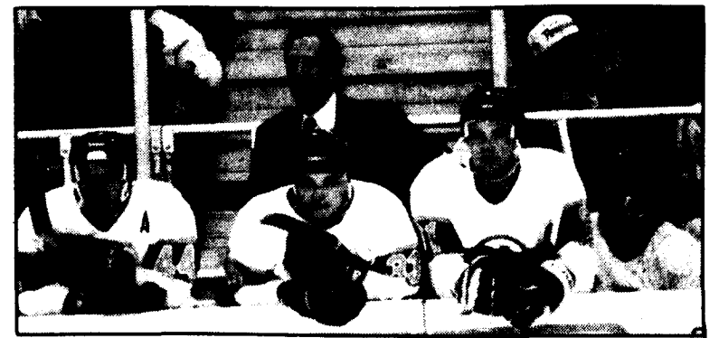
Panther coaching changes:

By today, the Panthers' roster must be down to 20 players. As of yesterday, about 25 were still in camp.