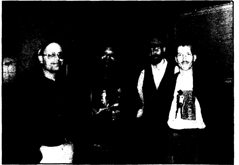
Blow this fish: Hootie and the Blowfish wrapped up their "365 days in a row" world tour. As you can see, Hootie and the rest of the 'fish are worn out. They finished their tour in Bruno's in the Reed Building. The Reed Building is near Erie Hall, where the basketball teams play.