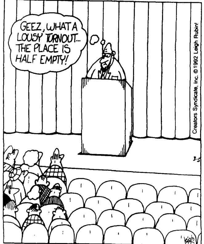
When a pessimist addresses the Optimists.