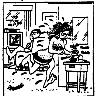
"Well it's about time, Alice! That thing has been ringing for the longest..."

PISCES (February 19 to March 20) You could be invited to a party that will take place in the near future. This week, though, your social plans seem to be up in the air. Someone is keeping you waiting, but try to be more patient.