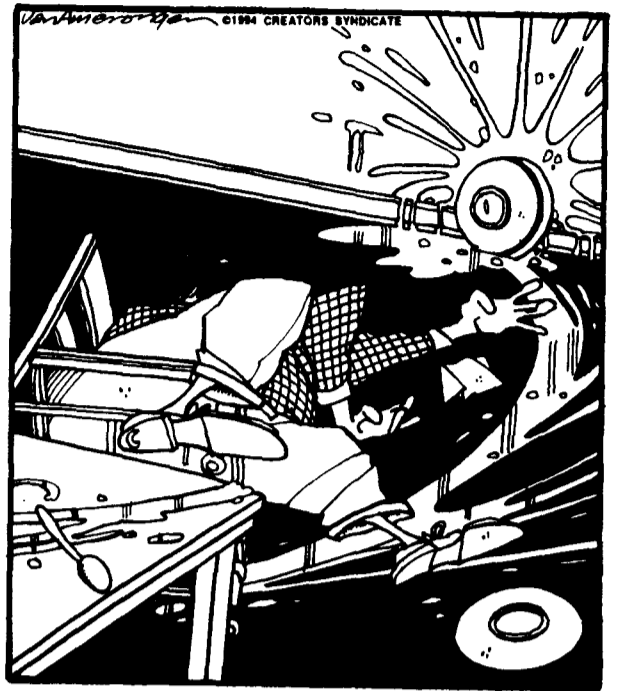
The oyster bisque didn't sit well with Tom.