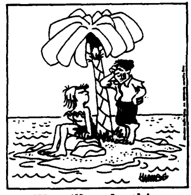
We still on for this weekend?"

If you like to sit in dark theaters, straining your eyes to see the numbers on your watch, then go see this movie.