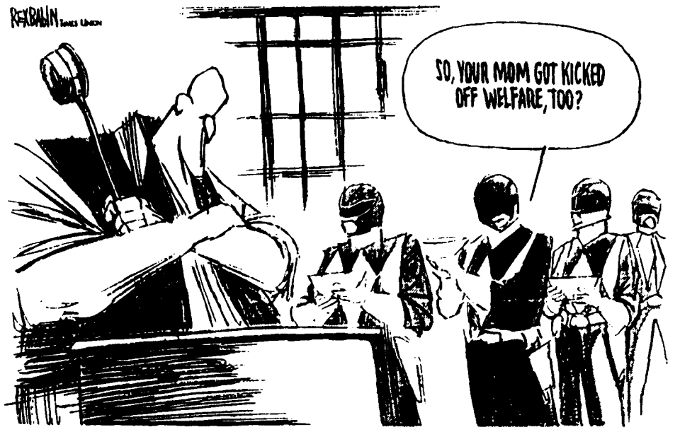
MIGHTY ORPHAN POWER RANGERS