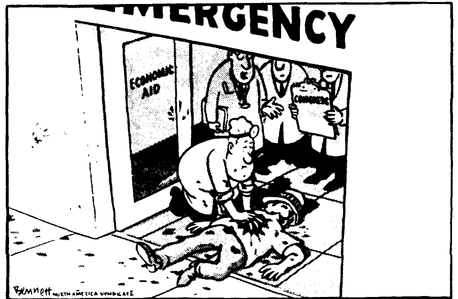
... We'd love to help, but he's not insured ...