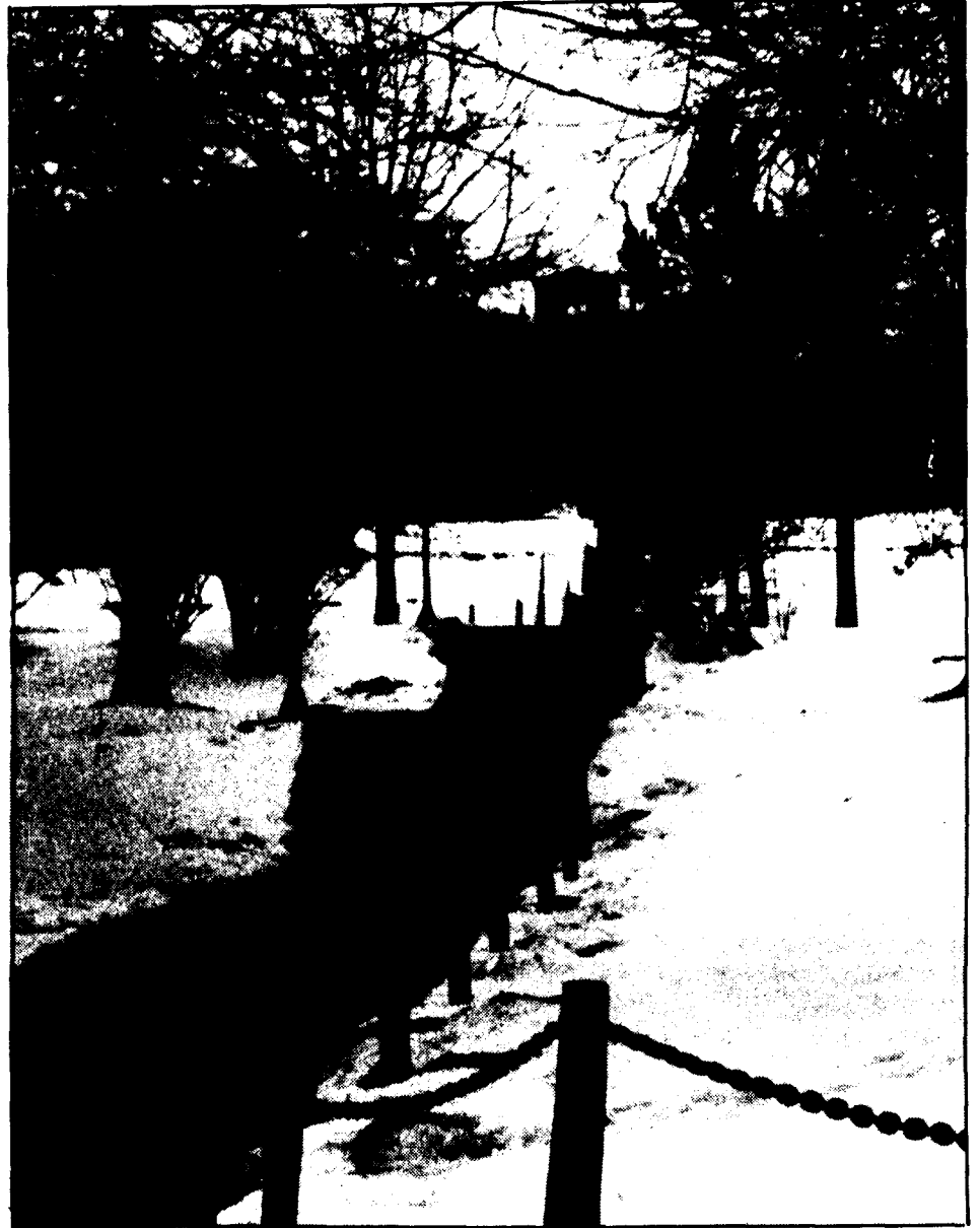
Behrend is riddled with stairs that plague wheelchairs.

a quarter of a million dollars. You can't just go get it. You have to go through the bureaucracy and that takes a long time. You can get into Reed, there is reasonable access."