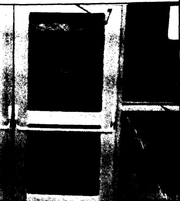
Most doors on campus can be opened with a wheelchair. Doors in the Reed Building are often times a day. (Right) The doors are often and often make it hard

"We have to be realistic. Looking at our environment, what can we possibly do? We don't want to destroy the environment completely. Ambience is part of Behrend's charm," she said.