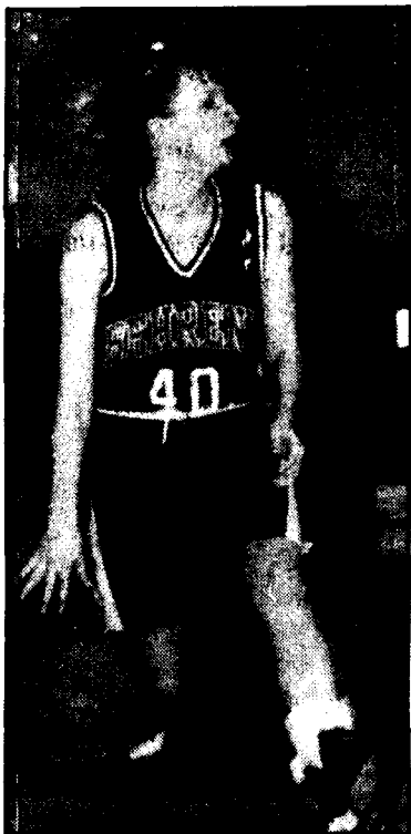
With the victory, Behrend raised its record to 10-11. Bethany fell to 12-9.