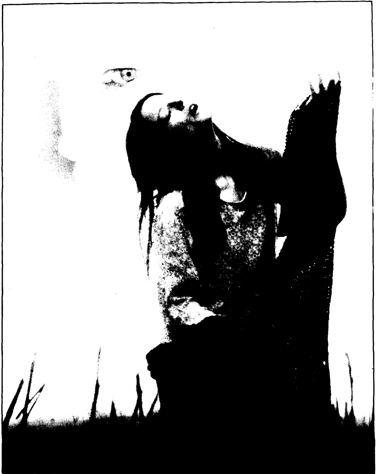
Dancing in a world of her own, two-time Academy Award winner, Jodie Foster stars as the title character in 'Nell'. Keeping an eye on her is costar, Academy Award winner, Liam Neeson as Dr. Lovell.

Nell's carefree world is the aspect I was most drawn to in this film. It's enlightening to know someone who is "one" with nature. Nell has never been burdened by the stresses that come with modern living, and she has no responsibilities. This film will take you back to the innocence you know as a child.