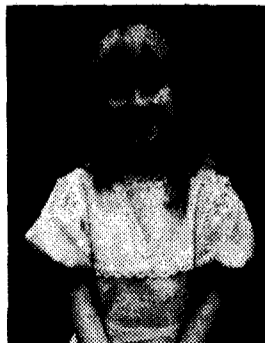
Easter 1988, Age 6