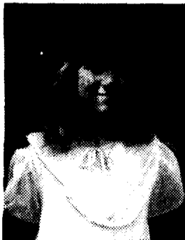
Easter 1987, Age 5