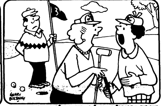
Differences: 1. Number is changed. 2. Cloud is moved. 3. Sweater is different. 4. Golf bag is missing. 5. Putter is longer. 6. Victor is different.