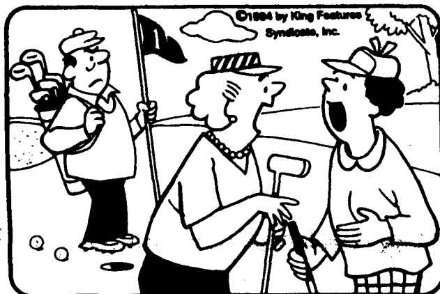
Find at least six differences in details between panels.