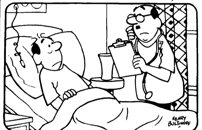
1. Buzzer is added. 2. Glass is removed. 3. Stethoscope is longer. 4. Clipboard is smaller. 5. Flowers are missing. 6. Drapes is different.