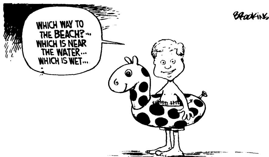
DAN QUAYLE SET TO TEST PRESIDENTIAL WATERS

The Behrend College Collegian welcomes letters to the editor on any subject. If you have anything you would like to share with the Behrend community, please drop your letter off in the Collegian office. We are next to the mail room in the Reed building.