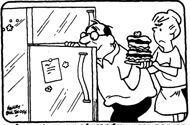
Differences: 1. Motes are removed, S. Glasses are added, 3. Descentialer, 4. Cabinets are missing, 5. Earling is removed, 8. Apron is longer.