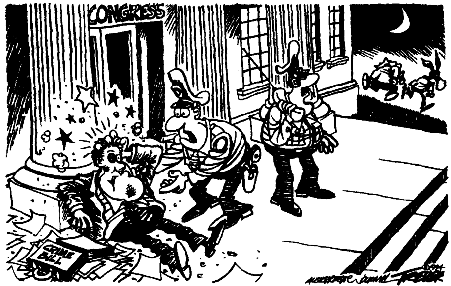
"HOLY COW, MISTER PRESIDENT. WHAT ARE YOU DOING IN THIS NEIGHBORHOOD WITHOUT AN ASSAULT WEAPON?!"