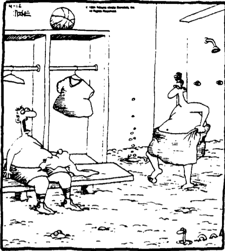
"Whoa, whoa, whoa! ... Word to the wise: You really don't want to walk around barefoot in this locker room."