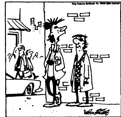
"My mom never complains about me not going to church with her."