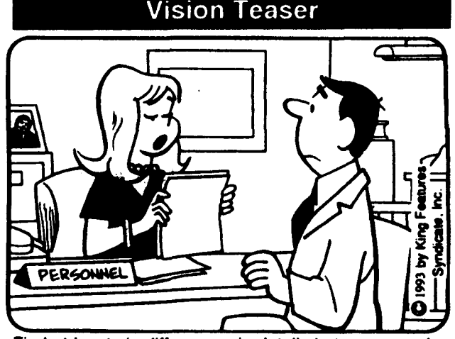
Find at least six differences in details between panels.

Chubby Checker History in New York City; 7. Pan; 8. 6. American Museum of Natural Boston; 4. Henry Ford; 5. Uruguay; 1. France; 2. Grover Cleveland; 3.