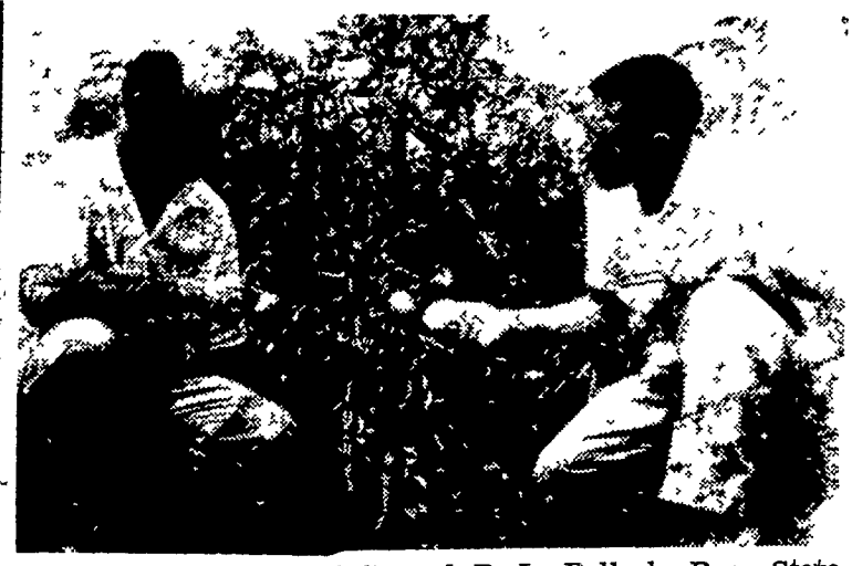
SHOWN ABOVE is one of Funk's double-vine Pa. 103 plants. Note the thick healthy vines and large, high-quality fruit, hanging in heavy cluster.