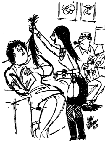
"He really digs me, Mom! He even gave me a lock of his hair."