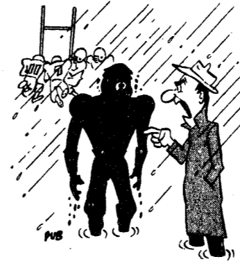
"So where were you on that play?"