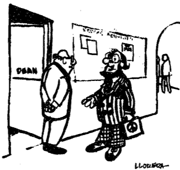
"This semester I'm bridging the communication gap."