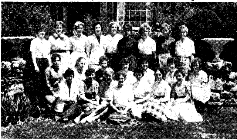
THETA SIGMA PI SORORITY GIRLS in the Highacres Gardens. The annual election for May Day was held by the Theta Sigma Pi Sorority. The results are as follows: