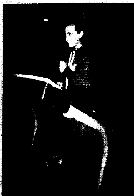
THE BEHREND BEACON

These are a few of my favorite songs to listen to when I run on the treadmill or lift weights. Most of them pump me up and help me push myself to work-out harder. I have most of these songs on my MP3 player and on CD so I can listen to them if I am working out at home or at the gym. Give them a try. I know you won't be disappointed.