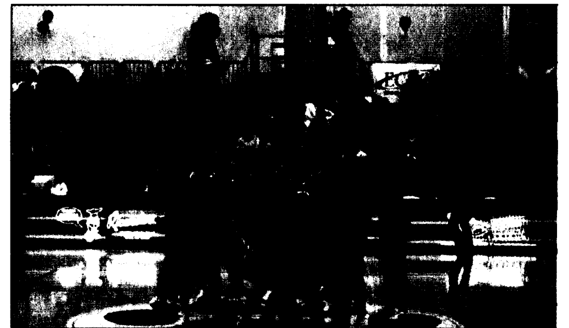
Check out Sports Page 9 to find out how much money the cheerleading and dance teams raised for the American Cancer Society.