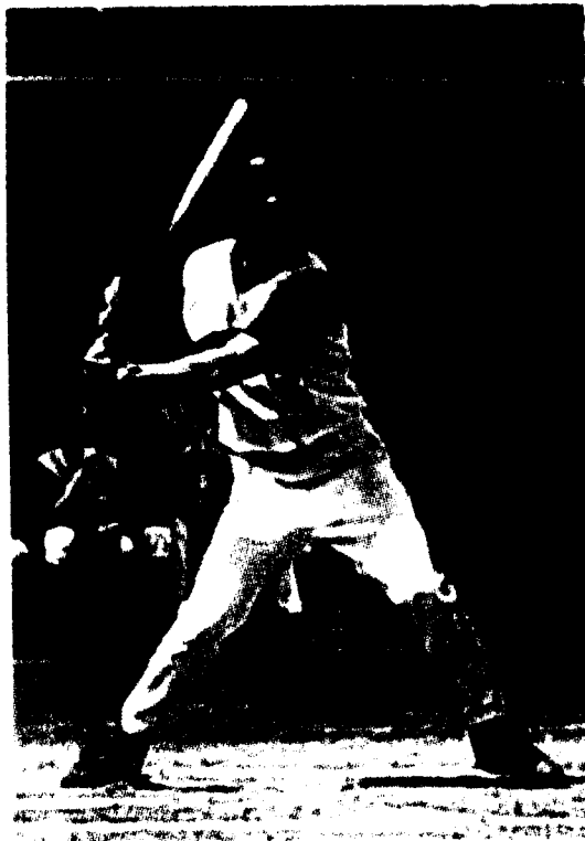
The Lions continue the conference season this weekend with a doubleheader at Pitt-Bradford on Saturday.

Behrend won the first game by a 5-4 score in